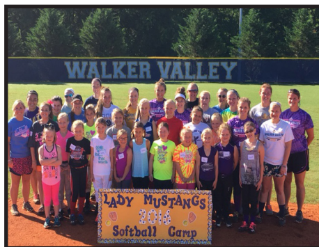
Lady Mustang Summer Camp

This summer marked the 4th year that the Walker Valley Lady Mustangs Softball team has hosted its softball camp for students in grades 2-8. This camp focuses on fundamental softball skills as well as leadership development. The camp not only benefits the young athletes, but provides leadership and mentoring opportunities for our high school players. During the last four years, over 150 young athletes have benefited not only from quality softball instruction, but from positive relationships built with high school athletes.