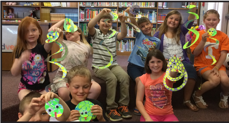
Lunch and Learn Students at Taylor Elementary

When that last bell rang back in May, most kids were dreaming of spending months away from the books and the deadlines of assignments. However, it's the summer months that have some students experiencing what is known as summer slide. Reading is an area that requires regular practice and repetition. Any child that doesn't practice literacy skills is going to experience some setback. Often students continue to learn through summer enrichment orchestrated by their families and the community, but some students lack access to these