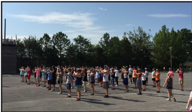
BCHS Band students getting ready to "Let the Games Begin"

The Bradley Central Bear Pride Band just finished up their Band Camp for the 2016 marching band season. The band has been working hard to prepare themselves for the upcoming season. We are also proud that the BCHS Band has over 100 members for the first time in several years. We are preparing our field show titled "Let The Games Begin" telling the story of a sporting event from the beginning to end. Selections for this show include "Let the Games Begin" by AJR, "My Songs Know What You Did In The Dark" by Fall Out Boy, "Lets Go", "Roar" by Katy Perry and a mashup of "All I Do Is Win" and "My Songs Know What You Did In The Dark". "This year we are looking forward to performing this fun and entertaining show for the BCHS Football fans as well as at several regional competitions.