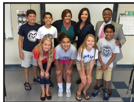
North Lee students with the GMC crew. North Lee Students won the competition 13-3.

This segment aired on Good Morning Chattanooga on Fox 61, Friday, July 29, 2016 at 7am.