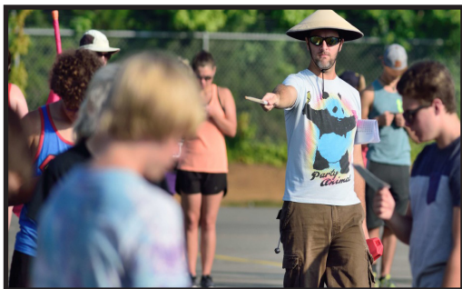
Members of the 2016 Mustang Band preparing "That's My Jam"