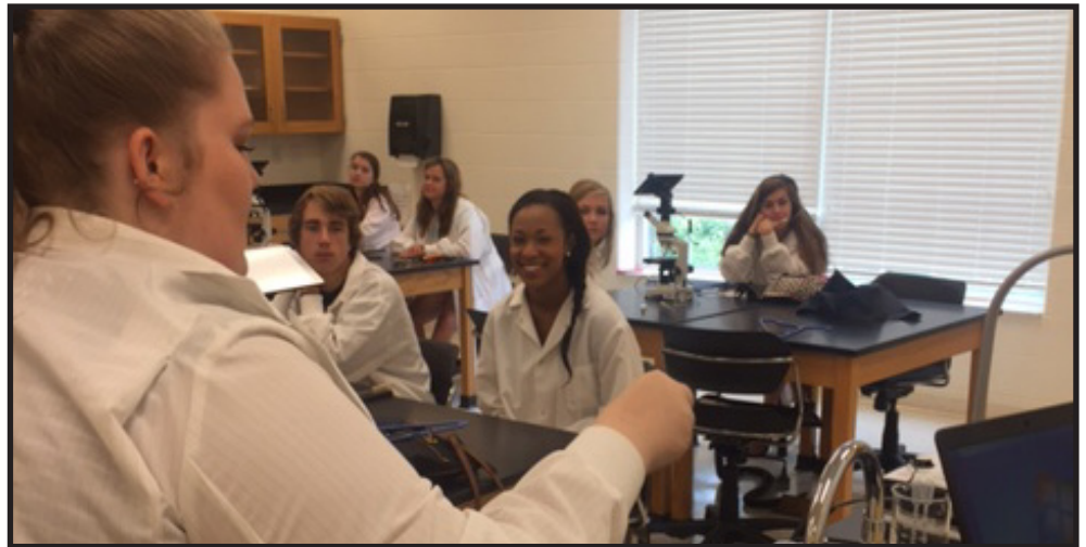
Pictured above -Students from the 2016 Health Science Camp at Lee University work in the lab. Three other camps were held to promote industry specific skills and trades.

Click Here to watch 2016 Health Science Camp Video Click Here to watch 2016 IT Camp Video Click Here to watch 2016 STEAM Camp Video