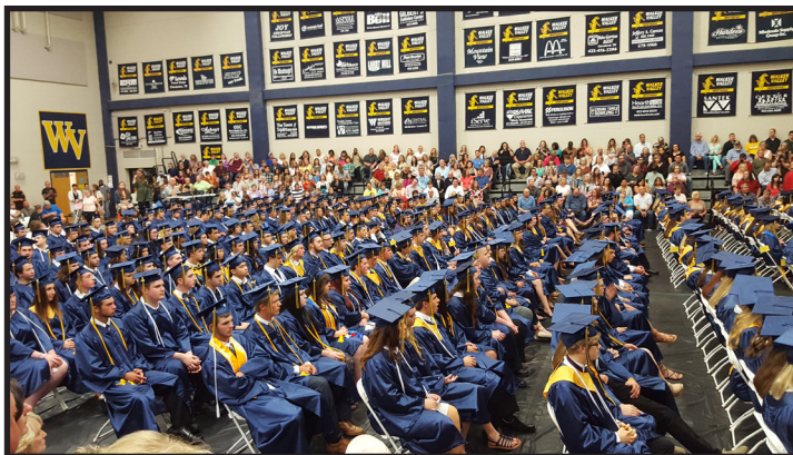
Graduation of the Walker Valley High School Class of 2016

graduates who earned a 4.0 GPA and an average ACT composite score of 28.36. There were 18 AP Scholar candidates with an average ACT composite score of 29.33. Additionally, 101 of the graduates met all four benchmarks on the ACT and graduated with State Honors. In the fall, the Walker Valley High Class of 2016 will be attending over 50 various colleges and universities including: University of Chicago, Georgetown University, American University, Macalester