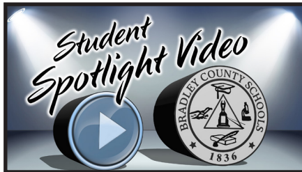
Student Spotlight - Natiyah Parker, Park View Elementary