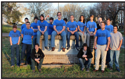
GOAL Academy's "B16 Deal" pays off in graduating one of it's largest class to date.

GOAL Academy seniors started this school year at Ocoee Retreat Center working on leadership skills and teamwork, thanks to the sponsorship of the Gear Up Grant. These students were challenged on both a low ropes and high ropes course to get them ready for the obstacles of senior year. They have worked